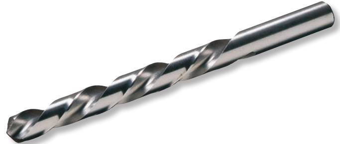
Style 150L Bright Finish